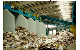
Once sorted, recyclable materials are moved