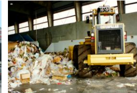
equipment onto the Walking Floors toward the processing