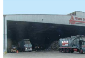
Trash collected is dumped onto the Tipping floor and moved with heavy

Please refer to this storyboard for a more detailed explanation of the how the recycling program works.