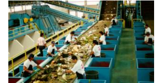
equipment where employees and machines will sort out the recyclables.