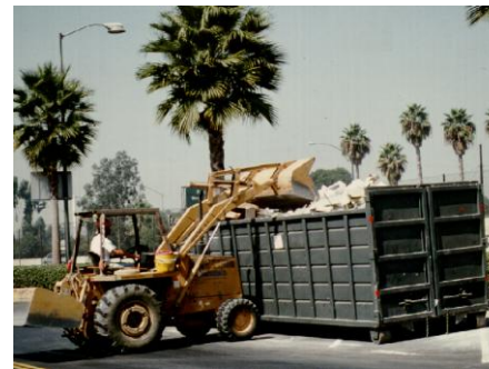
Construction Roll-Off Box

The standard 3 cubic yard trash bins as well as large roll-off boxes are taken to our Material Recovery Facility for processing.