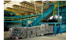
to the massive baler, where they are prepared