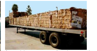
for shipment to foreign and domestic markets.

FREE TOURS of the facility are available to South Pasadena residents by calling (888) 336-6100.