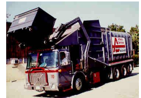
Standard 3 cubic yard trash bin

Processing of this waste is more expensive than simply dumping it all in a landfill, but the materials must be recycled as mandated by State Law AB939 which requires 50% diversion from landfill.