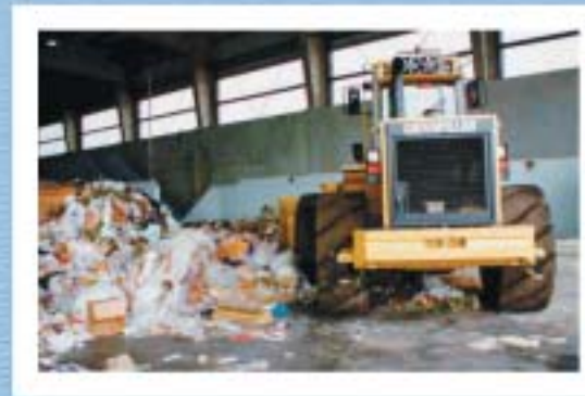
2. equipment onto the Walking Floors toward the processing equipment