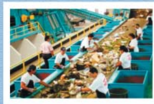
3. where employees and machines will sort out the recyclables.