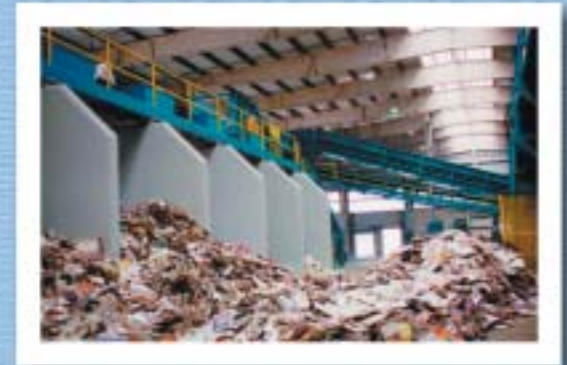
4. Once sorted, recyclable materials are moved via conveyor