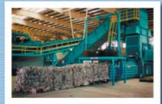
5. to the massive baler, where they are prepared