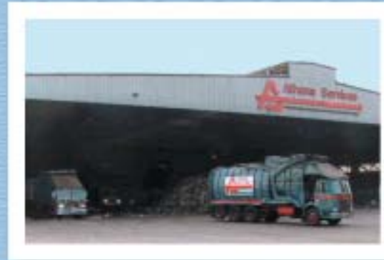
1. Trash collected is dumped onto the Tipping floor and moved with heavy

Please refer to the storyboard below for a more detailed explanation of the program.