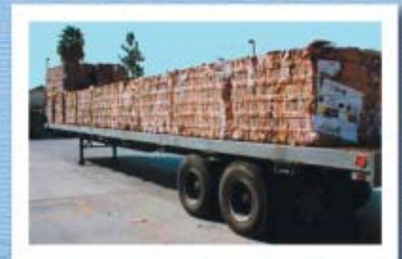
6. for shipment to foreign and domestic markets.