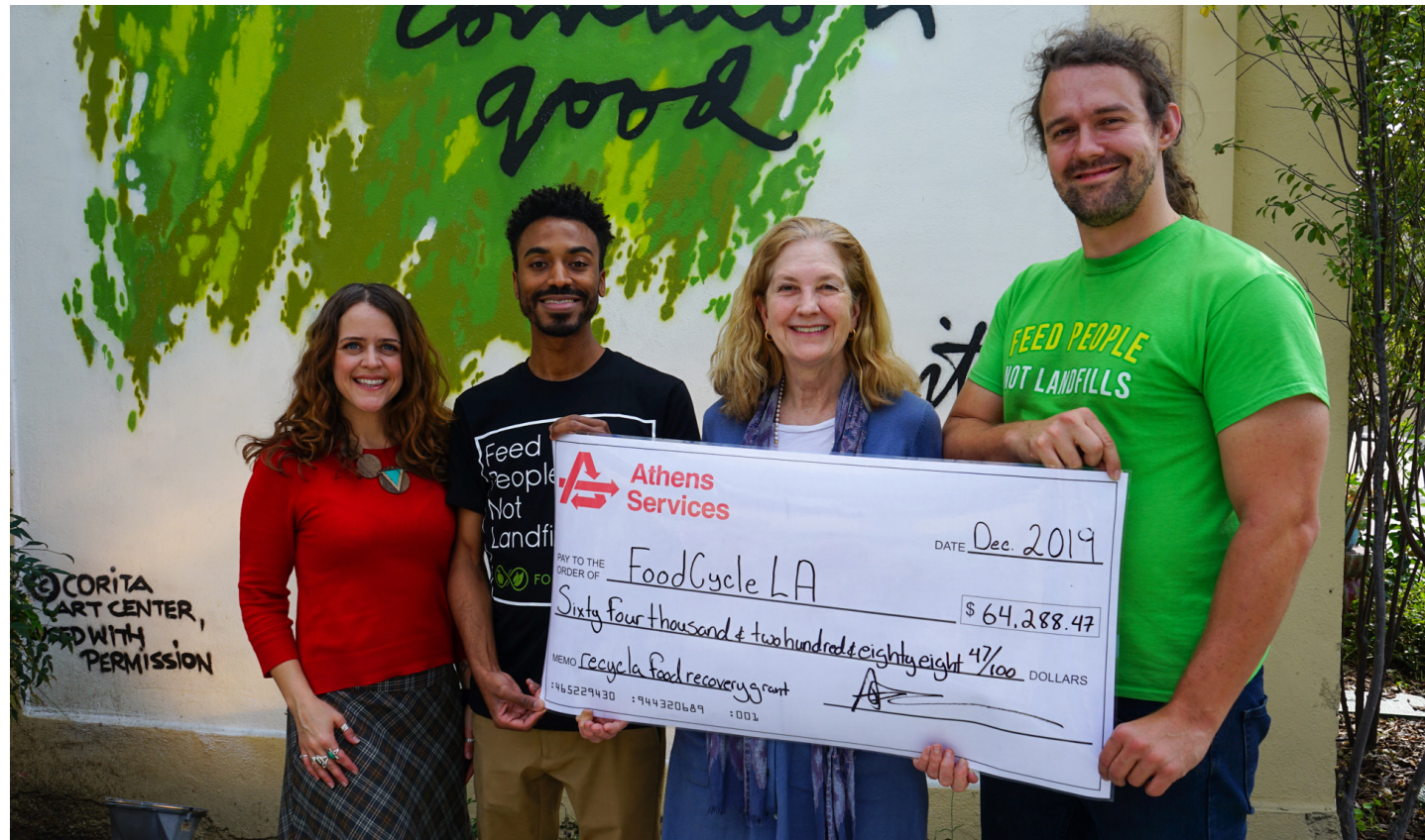
FoodCycla LA and Athens Services work together to ensure that edible food stays out of landfills and that no child goes hungry in our community.

Athens Services donates financial resources to advance the work of local nonprofit groups throughout Southern California. In 2021 alone, we contributed to approximately 200 different organizations and events throughout our expansive service area that spans Los Angeles, Ventura, Riverside, Orange, and San Bernardino Counties. Recipients included Boys & Girls Clubs, youth sports leagues, environmental organizations, business advocacy groups, hospitals and healthcare centers, education foundations, arts organizations, and many more. It's all part of being a good neighbor and a relentless advocate for the people and organizations we serve in Southern California.